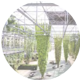
03 - Peaceful Sunken Garden - Private communal open space