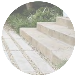
01 - Rear access lane and fire escape