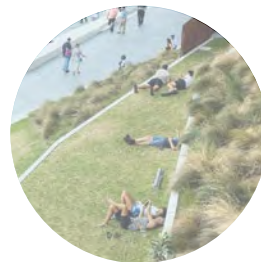
05 - Lawn and Terraced seating with shared street - Public open space