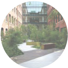
03 - Public Recreation Space